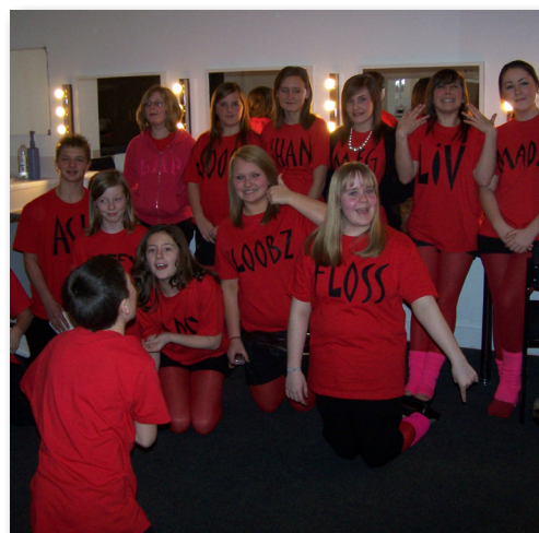
The Honeybourne Youth Club in Bewdley