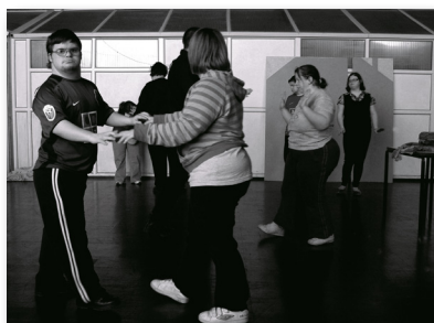
New Horizons Youth Arts Club