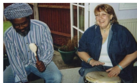
Talking Drums in Redditch